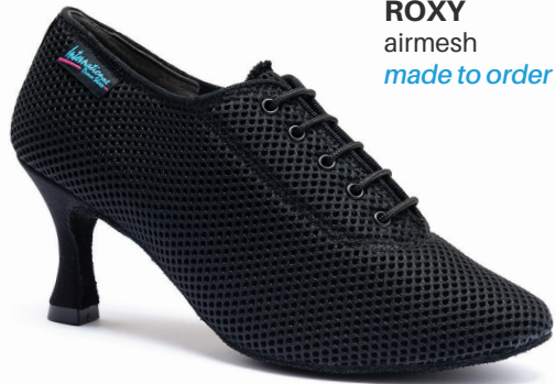
ROXY airmesh made to order