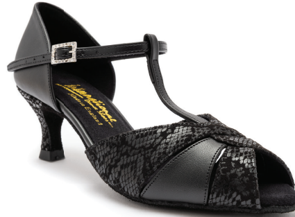
2002 black notcalf/ black snake made to order