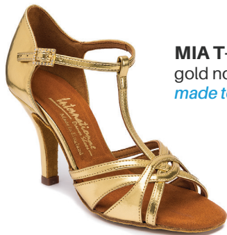
MIA T-BAR gold notcalf made to order