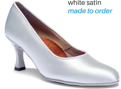
ICS ROUNDTOE white satin made to order