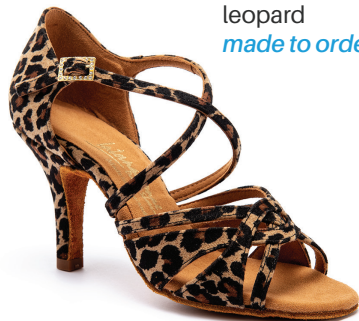
MIA leopard made to order