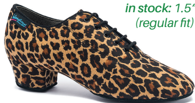
HEATHER SPLIT-SOLE leopard in stock: 1.5" (regular fit)