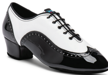
BROGUE white notcalf/ black patent bespoke