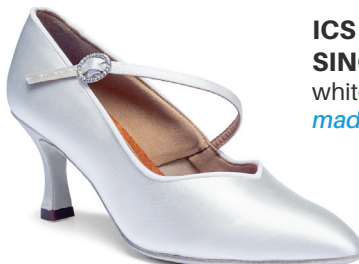
ICS SUPERSTAR SINGLESTRAP white satin made to order