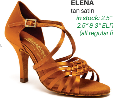
ELENA tan satin

GEL FOAM PADDING FROM THE BACK OF THE HEEL TO THE TIP OF THE TOE FOR COMFORT AND PROTECTION