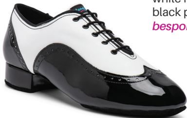
BROGUE white notcalf/ black patent bespoke