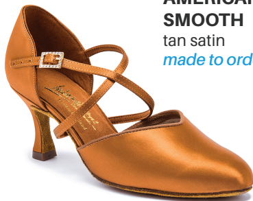
AMERICAN SMOOTH tan satin made to order