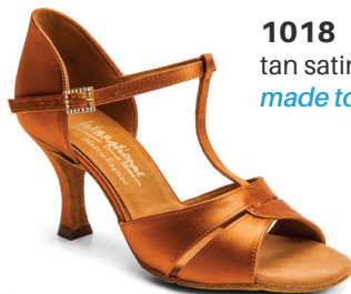
1018 tan satin made to order