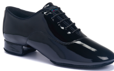
TANGO black patent made to order