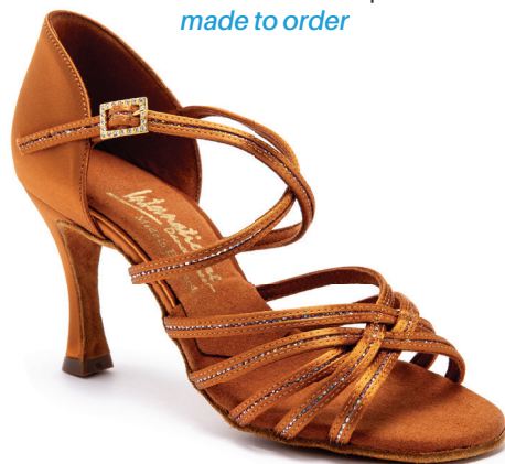
FLAVIA SEQUIN tan satin/tan sequin made to order