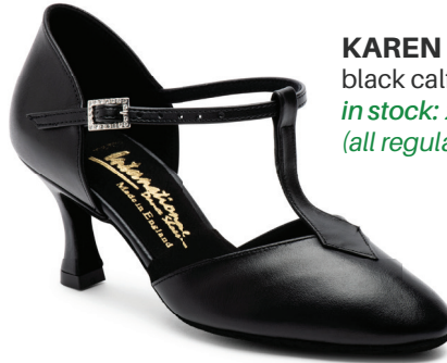
KAREN black calf in stock: 2" & 2.5" IDS (all regular fit)