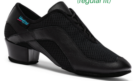
NEW FUSION SS black leather/airmesh in stock: 1.5" (regular fit)