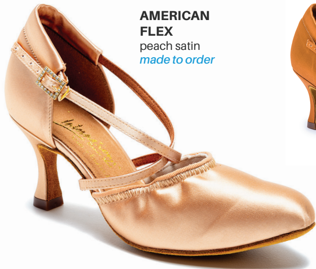
AMERICAN FLEX peach satin made to order