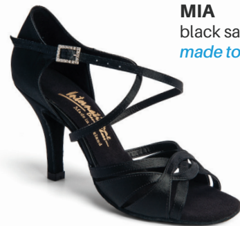
MIA black satin made to order