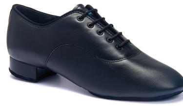
TANGO black calf made to order