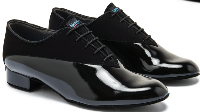
PINO FLEX black nubuck/ black patent made to order