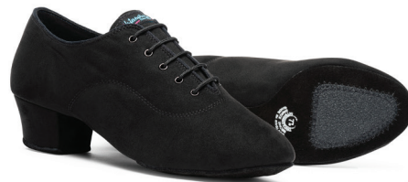
RUMBA black lycra in stock: 1.5" (regular fit)