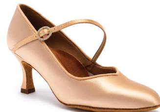
ICS VISTA SINGLESTRAP peach satin made to order