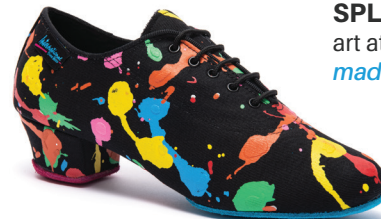
HEATHER SPLIT-SOLE art attack made to order