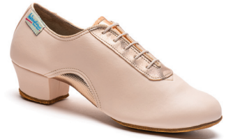
ARTISTE SS himalayan rose made to order