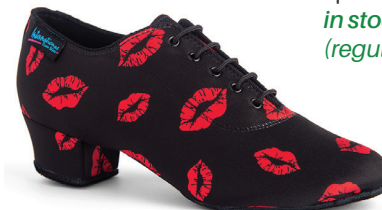
HEATHER SPLIT-SOLE lipstick in stock: 1.5" (regular fit)