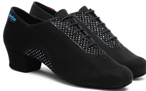
NEW ARTISTE SS black nubuck/ blacksilverhologram made to order