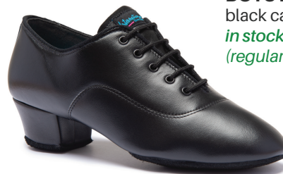
BOYS RUMBA black calf in stock: 1.5" (regular fit)

boys shoes: split-sole & full-sole the above shoes are our boys contra & boys rumba which are flexible, split-sole shoes. the boys tango looks just like the above shoes but is the not so flexible, full-sole option which is made to order