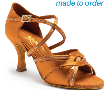
MIA SEQUIN tan satin/tan sequin made to order