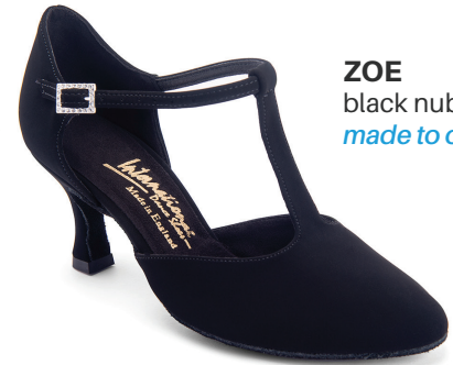
ZOE black nubuck made to order