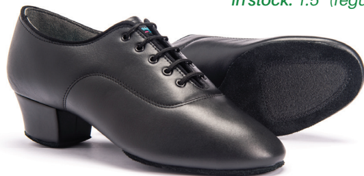
RUMBA XG black calf in stock: 1.5" (regular fit)