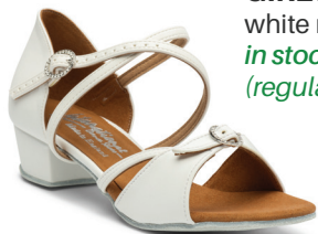
GIRLS NATASHA white notcalf in stock: 1.25" CUBAN (regular fit)