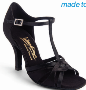
MIA T-BAR black satin made to order