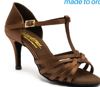
BELA cocoa satin made to order