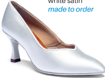
ICS SUPERSTAR white satin made to order