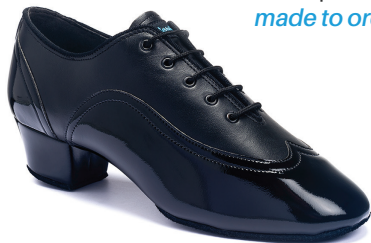
JONES black calf/ black patent made to order