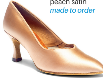
ICS SUPERSTAR peach satin made to order