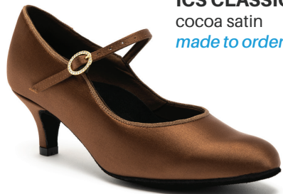
ICS CLASSIC cocoa satin made to order