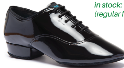
BOYS CONTRA black patent in stock: 1" (regular fit)