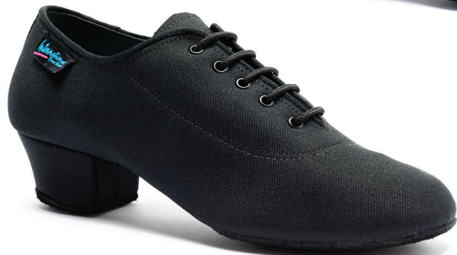
HEATHER SPLIT-SOLE black silver hologram in stock: 1.5" (regular fit)