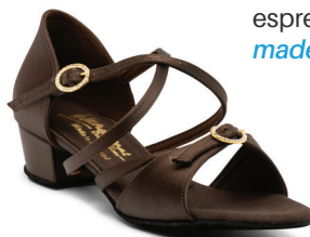
GIRLS NATASHA espresso satin made to order