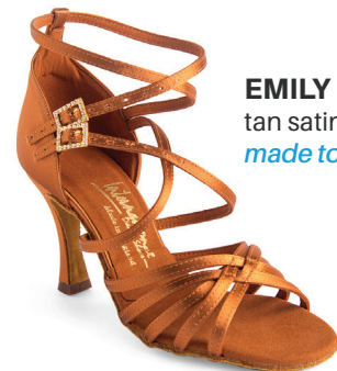
EMILY tan satin made to order