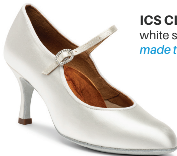
ICS CLASSIC white satin made to order