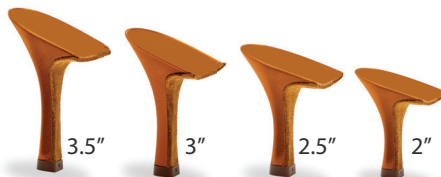
NEW VOGUE (for all shoes)