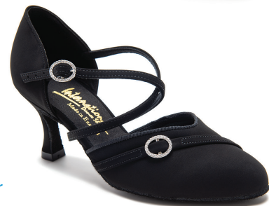
AMERICAN KLASS black nubuck made to order