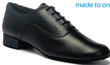
OXFORD black calf made to order