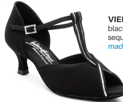
VIENNA SEQUIN black nubuck/silver sequin made to order