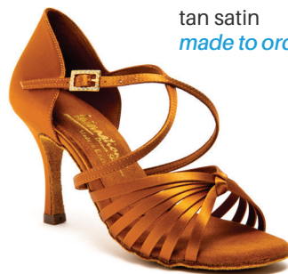
FIGURELLA tan satin made to order