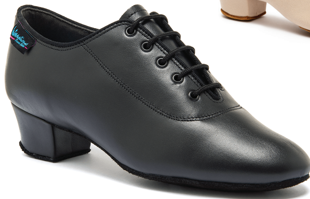
HEATHER FULL-SOLE black calf made to order