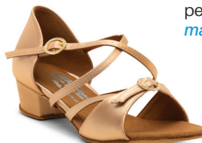
GIRLS NATASHA peach satin made to order