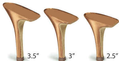
ULTRA SLIM (for latin/sandal shoes)