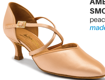
AMERICAN SMOOTH peach satin made to order