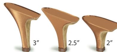
SLIM (for ballroom shoes)