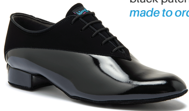
PINO black nubuck/ black patent made to order