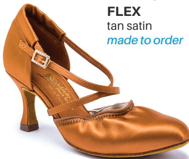
AMERICAN FLEX tan satin made to order