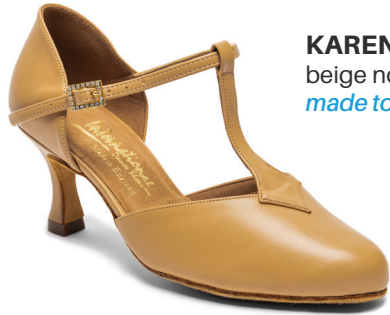
KAREN beige notcalf made to order