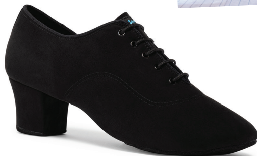
RUMBA black nubuck in stock: 1.5" (regular fit)