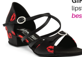
GIRLS NATASHA lipstick bespoke