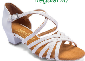
GIRLS FLAVIA white notcalf in stock: 1.25" CUBAN (regular fit)