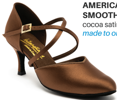
AMERICAN SMOOTH cocoa satin made to order