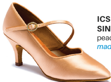
ICS SUPERSTAR SINGLESTRAP peach satin made to order