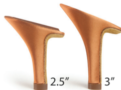
ELITE (for latin/sandal shoes)