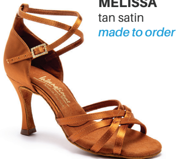
MELISSA tan satin made to order