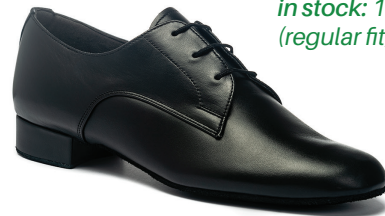
GIBSON black calf in stock: 1" (regular fit)