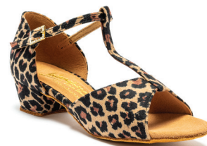
GIRLS KATIE leopard bespoke