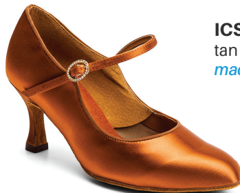
ICS CLASSIC tan satin made to order