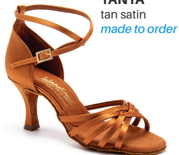
TANYA tan satin made to order