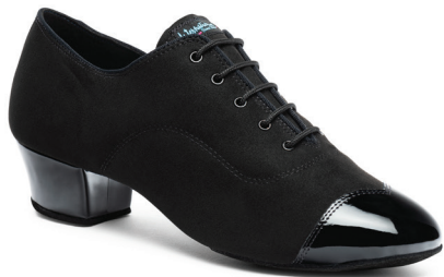
RUMBA DUO black nubuck/ black patent made to order