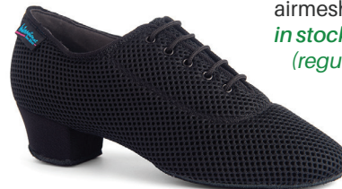
HEATHER SPLIT-SOLE airmesh in stock: 1.5" (regular fit)