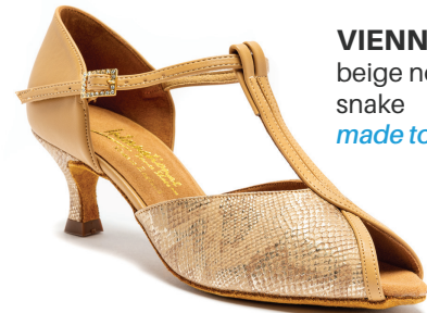
VIENNA beige notcalf/ beige snake made to order