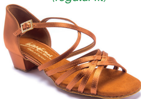
GIRLS FLAVIA tan satin in stock: 1.25" CUBAN (regular fit)