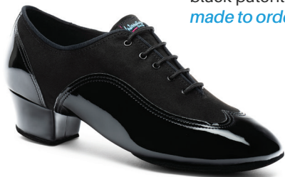
JONES black nubuck/ black patent made to order