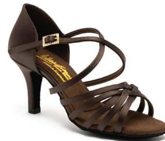
MIA silver notcalf made to order