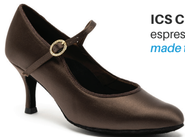
ICS CLASSIC espresso satin made to order