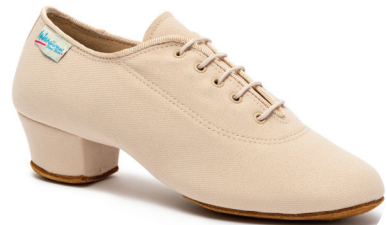
HEATHER SPLIT-SOLE beige lycra made to order