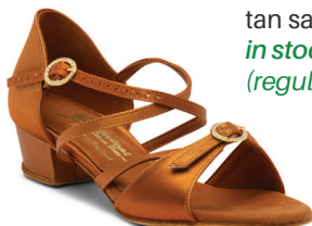
GIRLS NATASHA tan satin in stock: 1.25" CUBAN (regular fit)