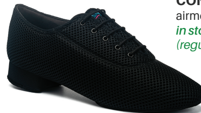
CONTRA airmesh in stock: 1" (regular fit)