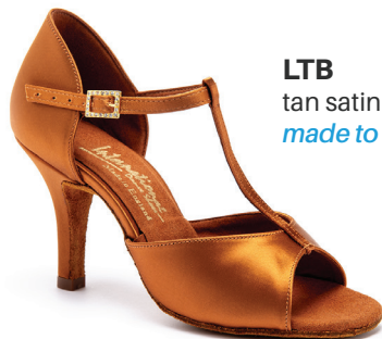
LTB tan satin made to order