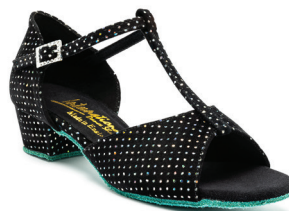
GIRLS KATIE black silver verhologram bespoke