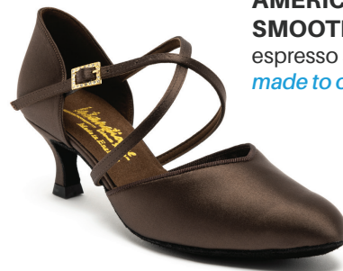
AMERICAN SMOOTH espresso satin made to order