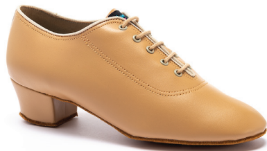
HEATHER FULL-SOLE beige notcalf made to order