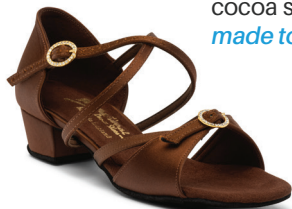
GIRLS NATASHA cocoa satin made to order