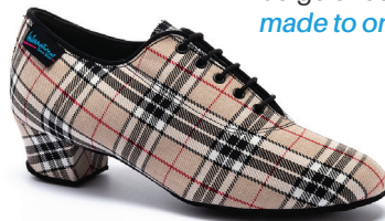
HEATHER SPLIT-SOLE beige check made to order